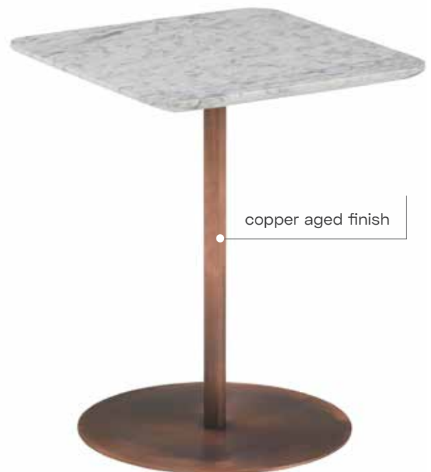
copper aged finish