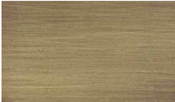
goldy aged finish