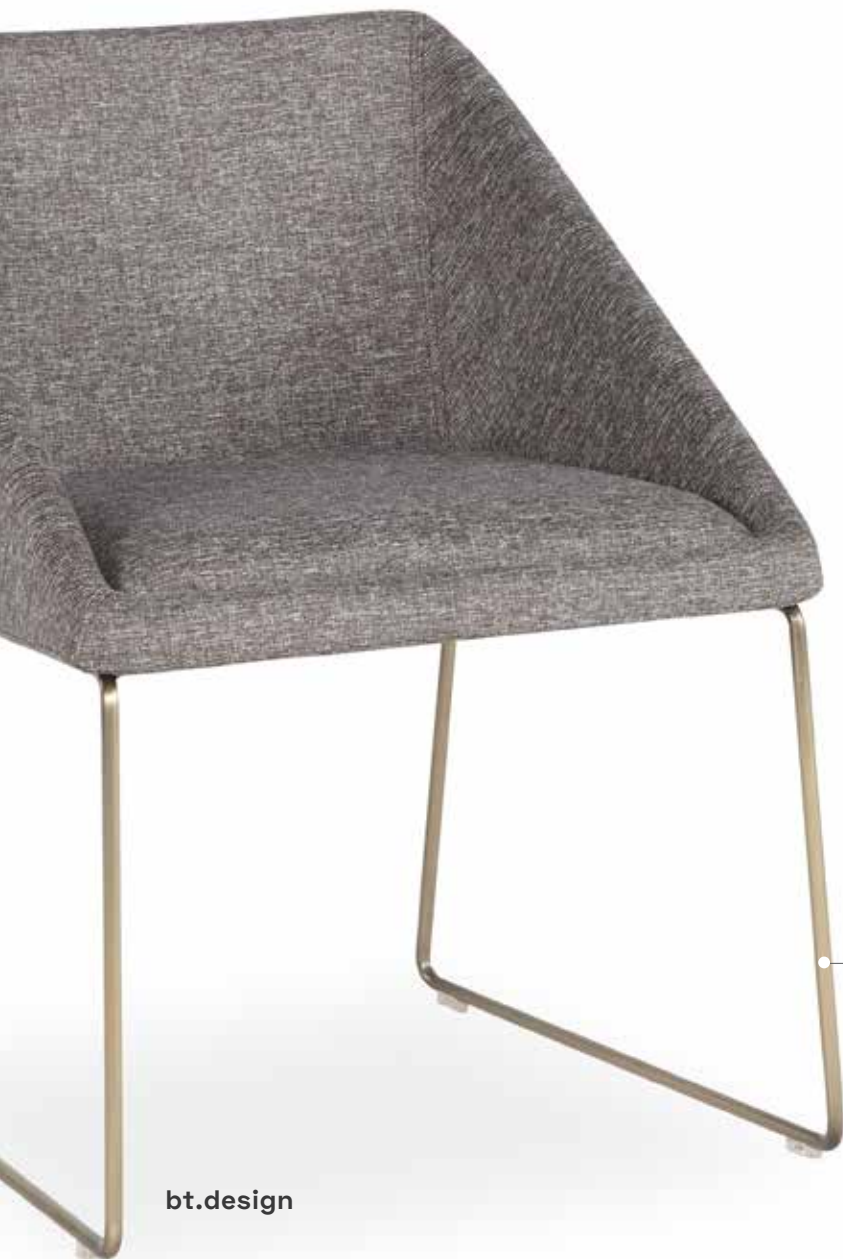
goldy aged finish