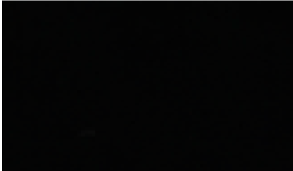
black RAL 9005