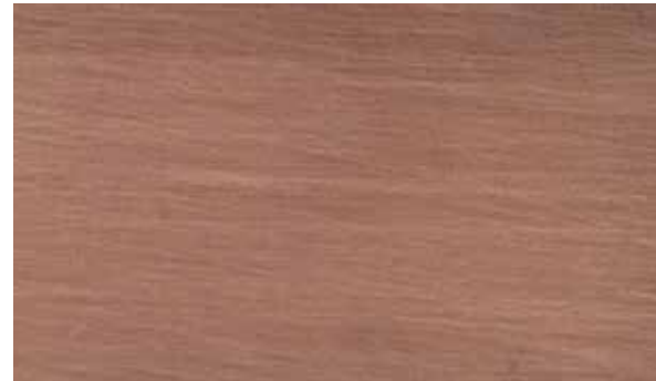
copper aged finish