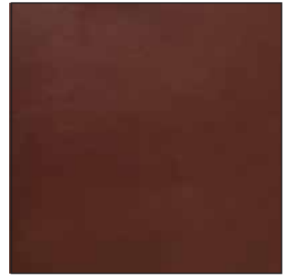
COGNAC top grain leather