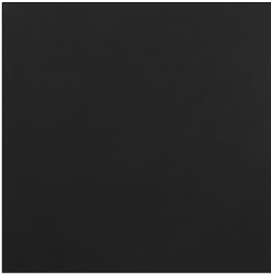
BLACK top grain leather