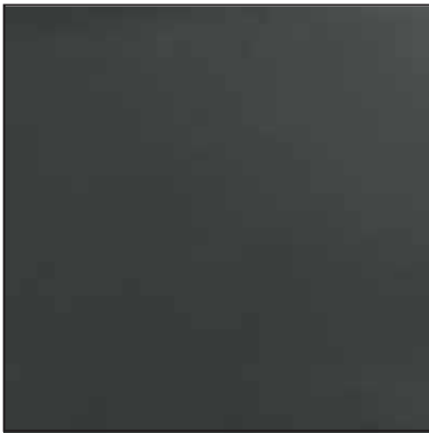
RACING GREEN top grain leather