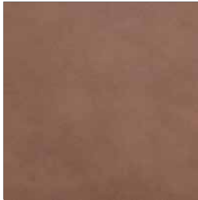
CHESTNUT top grain leather