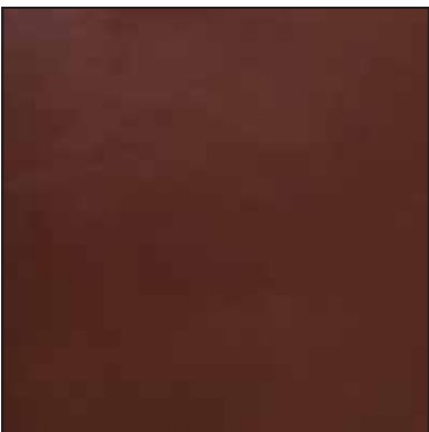
COGNAC PU leather