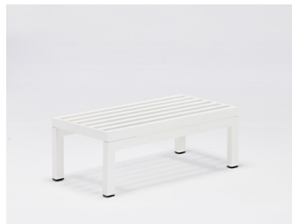
Fields Low Side Table