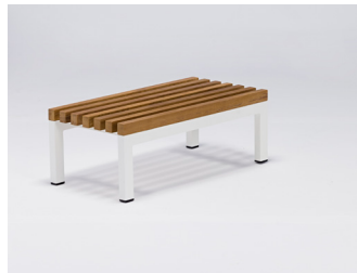
Fields Low Side Table