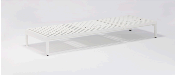
Fields Base 3 Seater