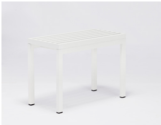
Fields High Side Table