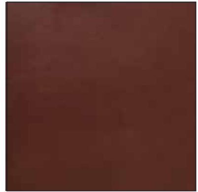
COGNAC top grain leather